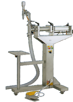
GC-BL Filling Machine for Liquid