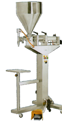
GCG-BL Filling Machine for Viscosity